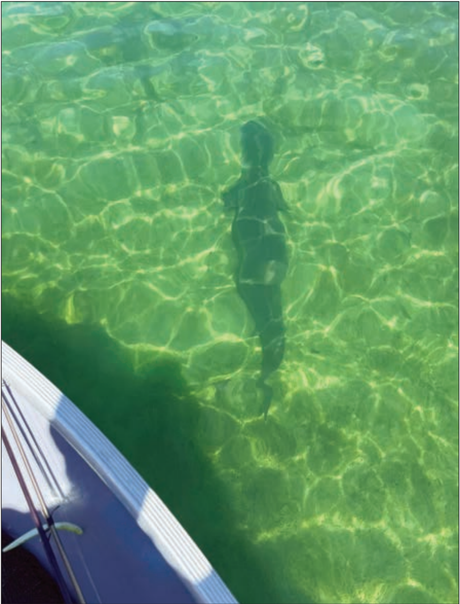
Waupaca High School anglers Ryder Vergauwen and Jay Card spotted a sturgeon on the Chain O’ Lakes. They were hunting panfish on Columbia Lake when the leviathan cruised by the boat. They estimated the fish to be approximately ten feet long.

also planted an apple tree in front of the range. The tree is a living symbol of the love Bailey had for deer hunting. He planted many apple trees over the years to improve wildlife habitat.