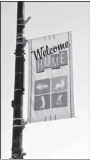
New Banners and trash cans have been added to Iola’s downtown area, soon to follow will be benches and flowers.