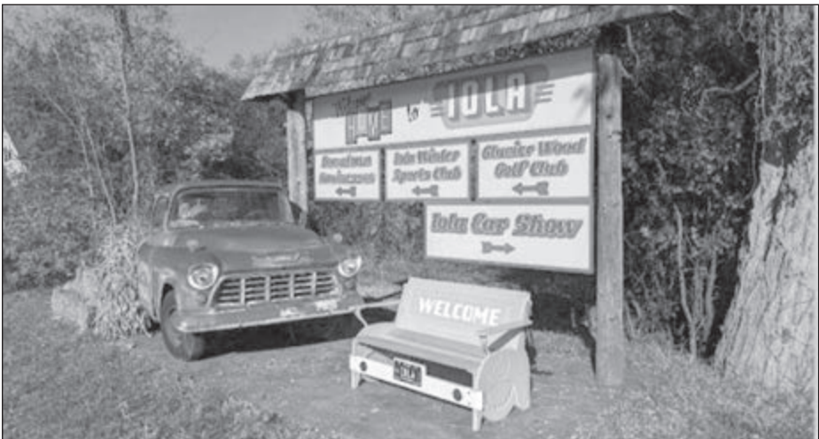
The benches were cast by the Waupaca Foundry and were a collaborative effort. Submitted Photo