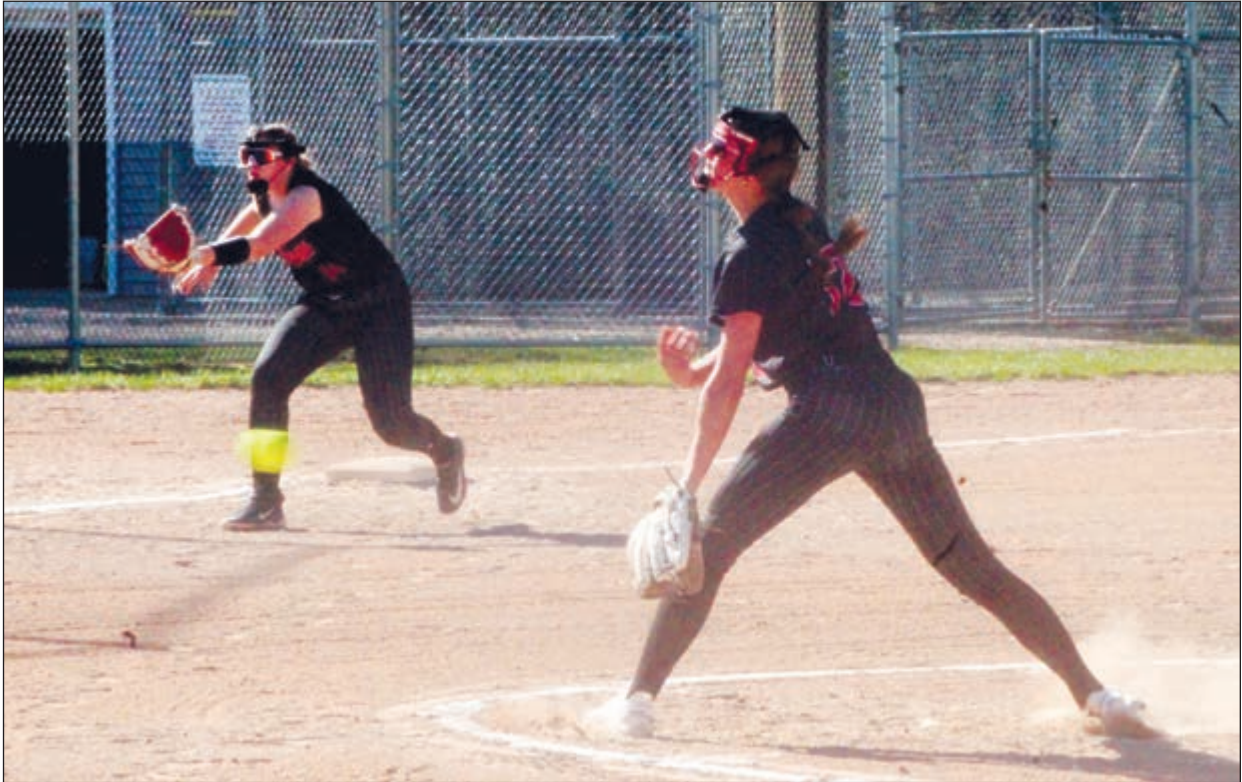
New London Bulldogs softball takes on Bay Conference rival Shawano on May 6.

St. Peter Lutheran (WELS) 312 W. Main St., Weyauwega Services 4:00 pm Saturday, 8:00 am and 10:30 am on Sunday. (920)867-3169 www.splwega.net