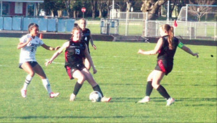
Bulldogs try to slowdown the high powered offense of Xavier.