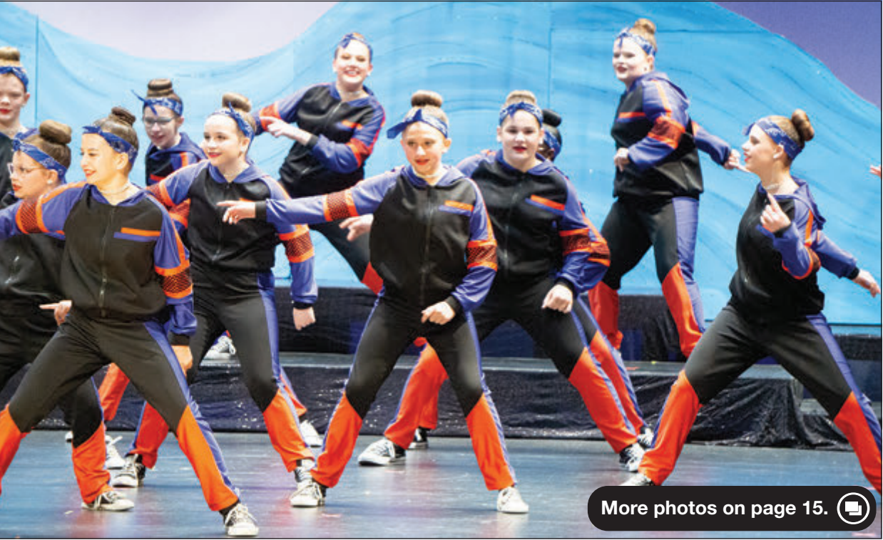
More photos on page 15.