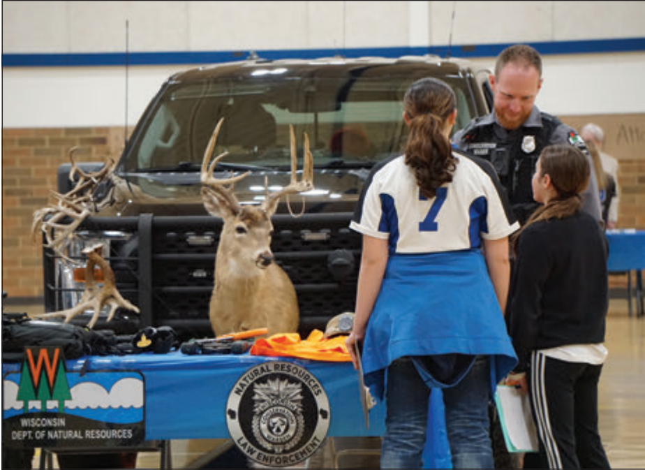
Students speak with the warden at the Wisconsin Department of Natural Resources booth.