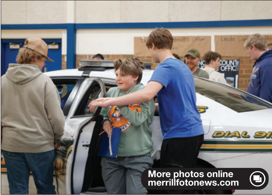
Students check out the inside of a Lincoln County Sheriff’s Department squad car.

LAW from page 1 federal legal systems. These individuals interact with the eighth graders to focus on the Optimist Club purpose: “To promote an active interest in good government; to inspire respect for the law...” Such interaction enables and encourages the students to ask questions and to learn more about careers in law-related fields. This year’s keynote speaker was Wisconsin’s Secretary of State Sarah Godlewski, who has served since March 2023, who explained the different functions of government and her office in particular. Special guest Ann Walsh Bradley, formerly a Marathon County judge and now Supreme Court Justice, and newly-named Chief Justice of the Wisconsin Supreme Court after being elected to the role by her peers, also came to PRMS for the event and spoke personally with many students. It was her first day as Chief Justice. Approximately 150 students in the eighth grade from PRMS and other Merrill schools were in attendance.