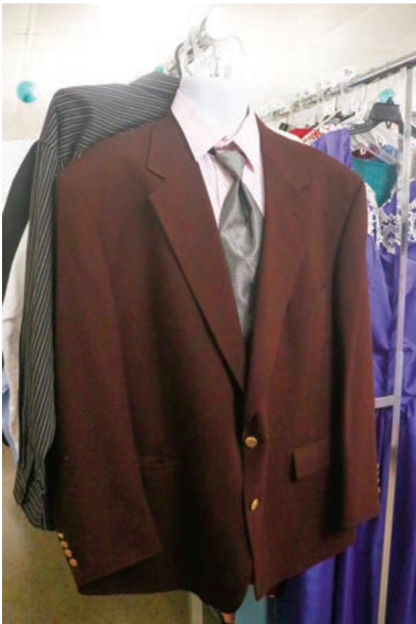
Grooms have plenty of suits to choose from as well.