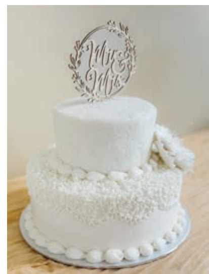
In the Moment Photography