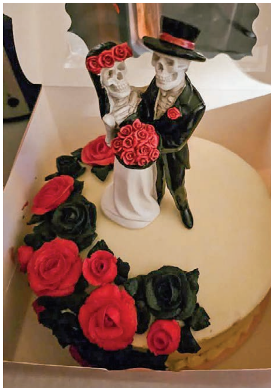
Kristin used her creativity to design a cake around the pre-picked topper.

Kristin's Kitchen Bakery is located at 1151 Main St., Wild Rose. Kristin offers a wedding package that includes cake tasting. She also has displays available for rent. If you are interested in booking Kristin for your wedding you can reach her at, (920) 765-0799.