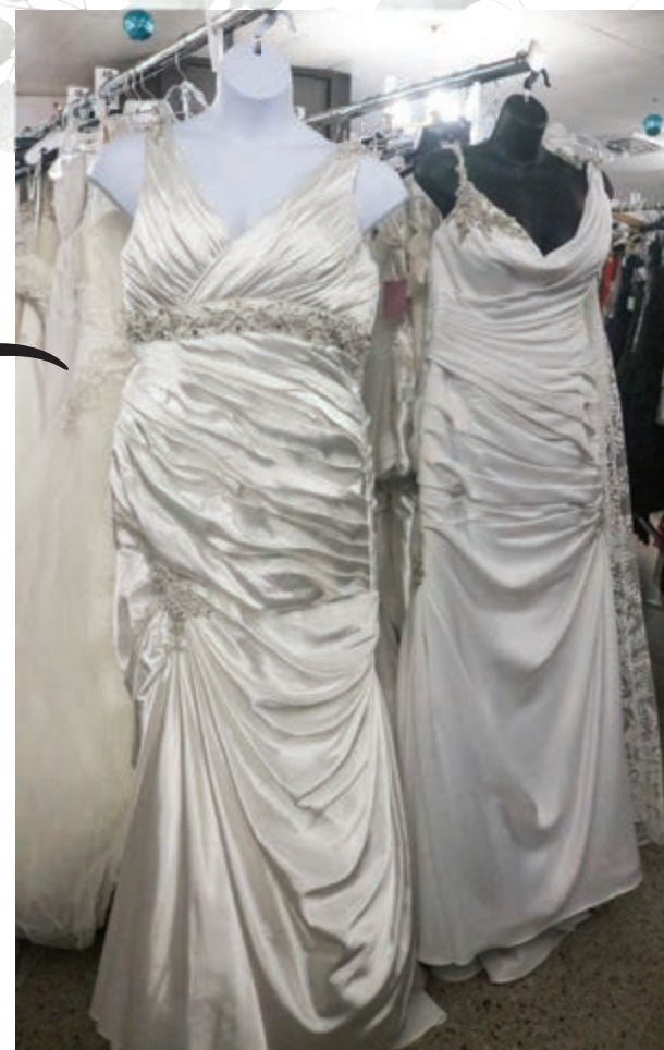
Wedding dresses are available in all shapes and sizes for the bride-to-be.

A wide variety of formal wear is available for anyone in your wedding party - including suits,