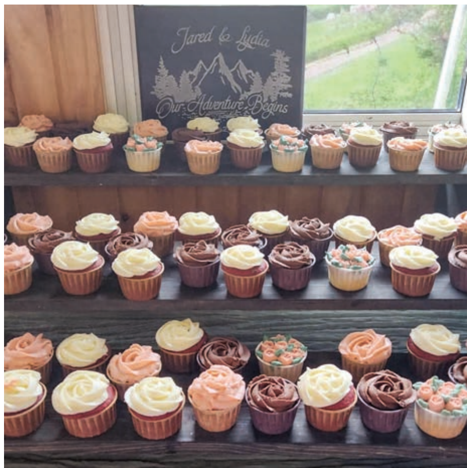
Assorted cupcakes could make your day sweet.