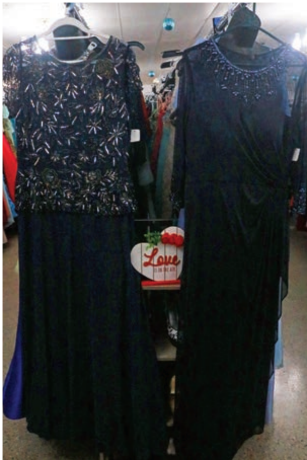
Mother-of-the-Bride dresses are some of the most popular selections at Dreams Can Happen.