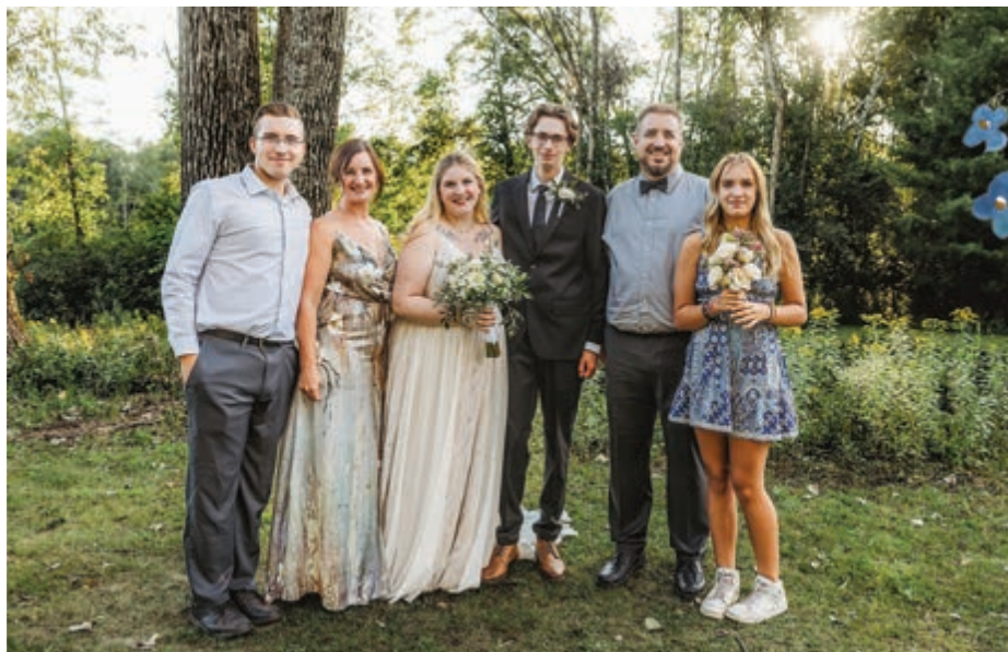
In the Moment Photography