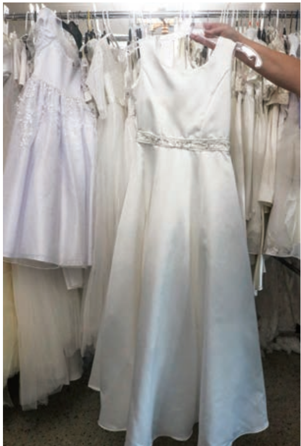
Dreams Can Happen also now has a great selection of children's dresses.