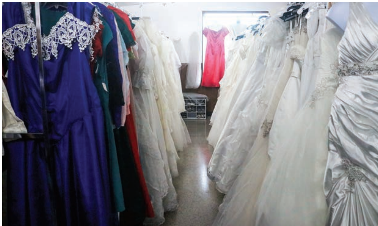
Wedding dresses are available in all shapes and sizes for the bride-to-be.

Throughout its 11 years, Dreams Can Happen remains a donation-based dress shop. Patrons are just asked to provide a donation, which goes towards holding the Special Needs Prom each year. This year's Special Needs Prom is set for Saturday, May 10 with a Kentucky Derby theme.