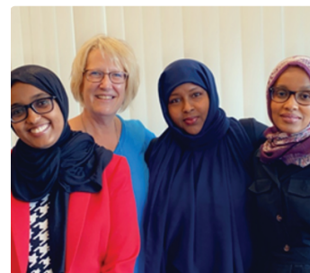
"Our community will build back better and stronger...if there is anything that Diamonds can do to give back to the community, we would love to chance to do so."

Diamonds: Our community will build back better and stronger through tough times like this. And if there is anything that Diamonds can do to give back to the community, we would love the chance to so.