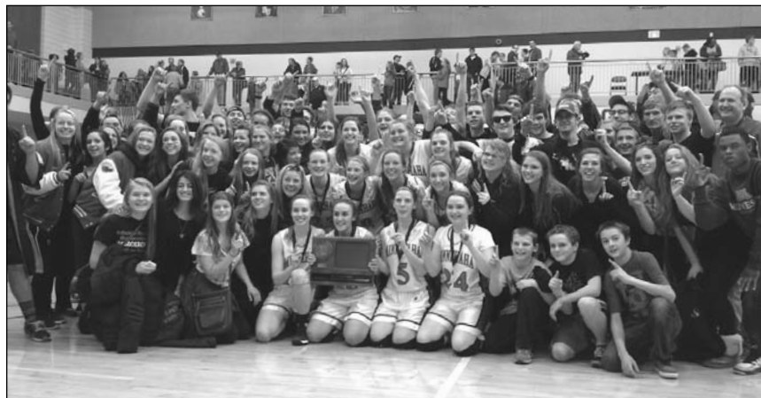
The Minnehaha Academy Redhawks won their section as the No. 3 seed to advance to their seventh state tournament in ten years.

At the state tournament, the Redhawks took a No. 5 seed as they competed in the Class AA tourney, losing to Howard Lake-Waverly-Winsted 62-43. Leading up to the tournament, the Redhawks compiled a record of 20-8 along with the Section 4AA title.