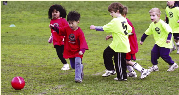
Blackhawks offer several exciting half- and full-day camps for players ages 5-18 that encompass a wide variety of activities and skills.

(Editor's Note: This is not a comprehensive list of every camp in the Twin Cities. If you would like to be included in next year's guide, please send us detailed information on the camp by Jan. 15, 2015 and we'll try to include as many as we can.)