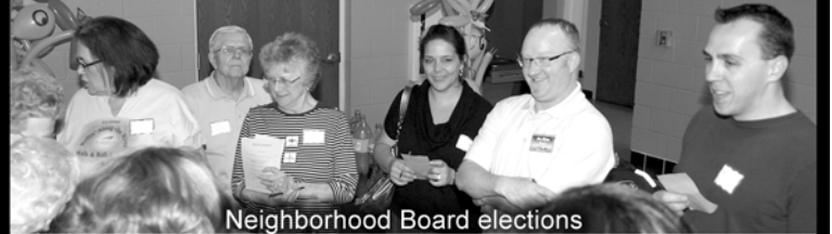
Neighborhood Board elections

We'll have light refreshments (sorry, no dinner) and as always, the Noki (Best of Nokomis) Award presentation.