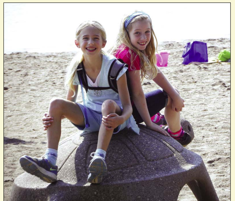
A variety of athletic, academic and enrichment programs are offered at Minnehaha Academy, including woodworking, Lego robotics, rocket science, geocaching, fencing, sailing, painting, microelectronics, guitar, and more.

Call 612-728-7745 or visit MinnehahaAcademy.net for a catalog.