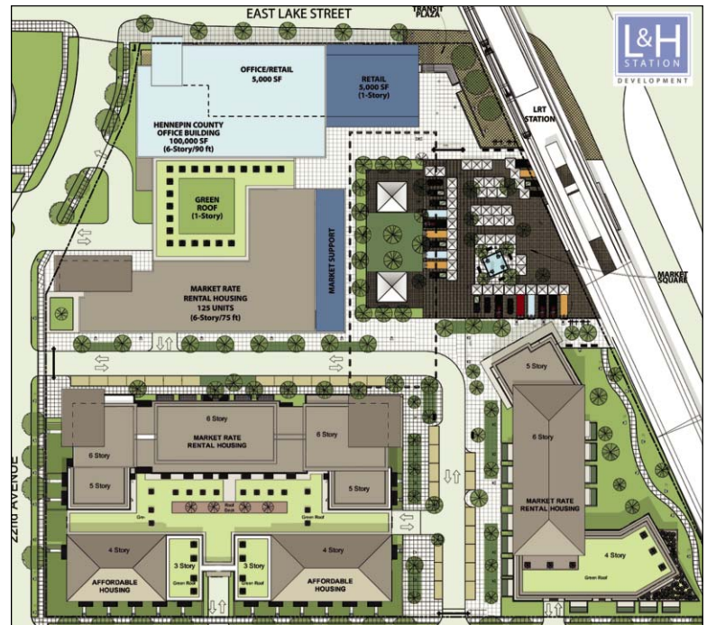
The current multi-phase plan to redevelop the 6.4-acre property at 2225 E. Lake St. would be anchored by a Hennepin County Family Service Center. Phase one includes 100,000 square feet of offices and 10,000 to 15,000 square feet of retail plus 125 apartments.

The current multi-phase plan to redevelop the 6.4-acre property at 2225 E. Lake St. would be anchored by a Hennepin County Family Service Center. The county is seeking to disperse some servic-