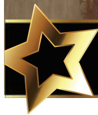
BEST RESIDENTIAL/COMMERICAL CLEANER The Klean Sweep Team