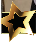
BEST DENTIST | Rockwood Family Dental