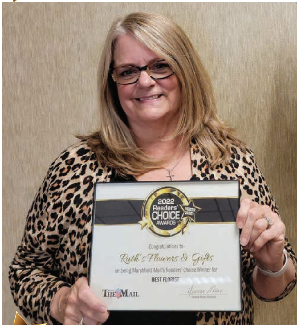
BEST FLORIST | Ruth's Flowers & Gifts