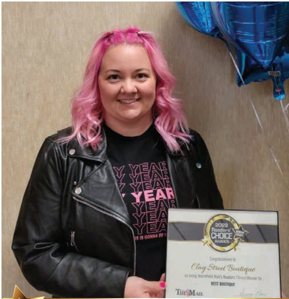
BEST BOUTIQUE | Clay Street Boutique