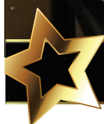
BEST AUCTIONEER | Hoover Case