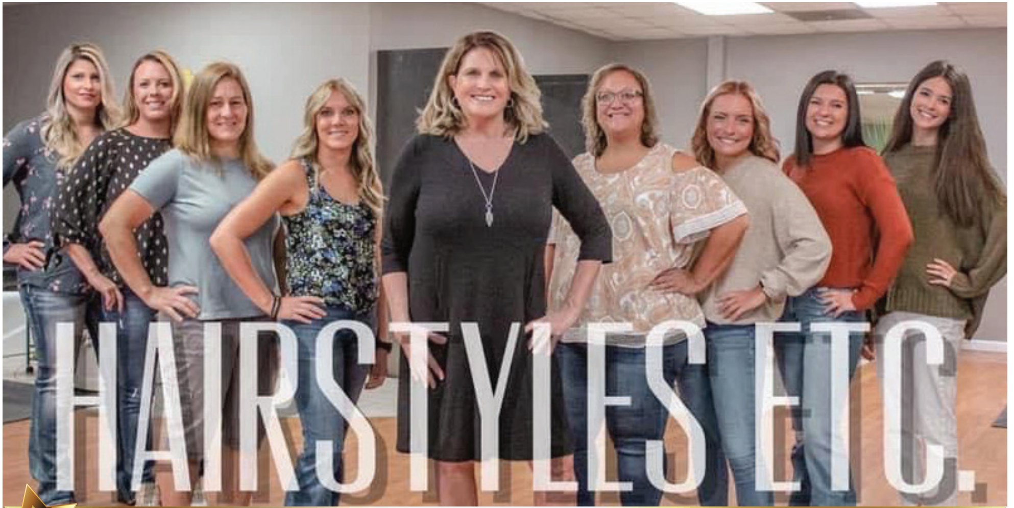
BEST HAIR SALON | Hair Styles Etc.