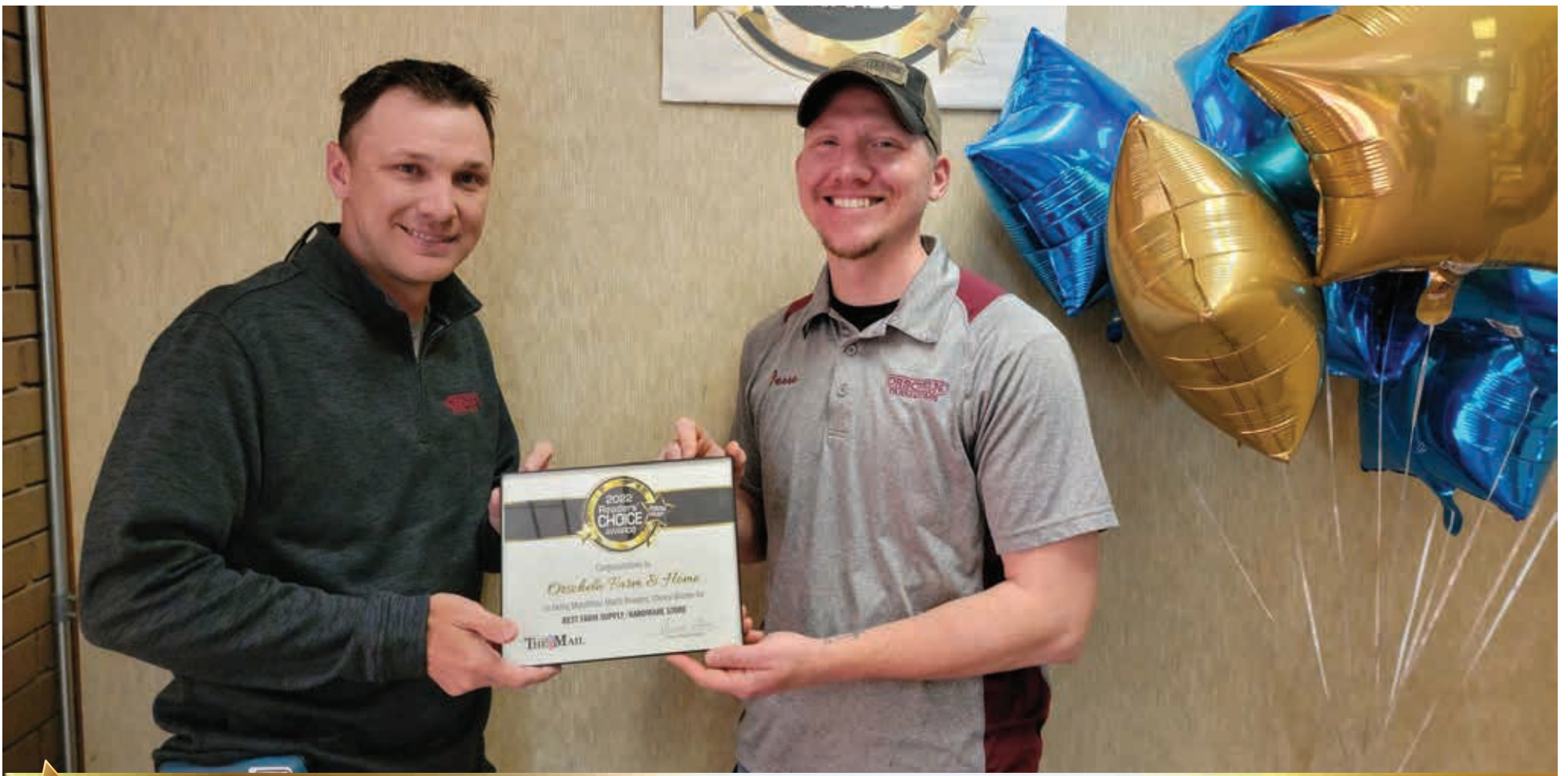
BEST FARM SUPPLY/HARDWARE STORE Orschelns Farm & Home