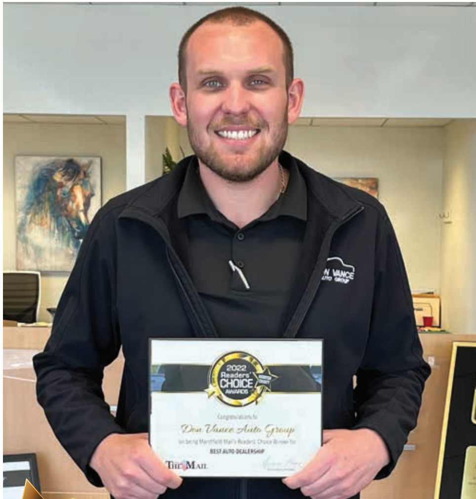
BEST AUTO GROUP | Don Vance Ford

WINNER: Little Blessings RUNNER-UP: 1st Kid's