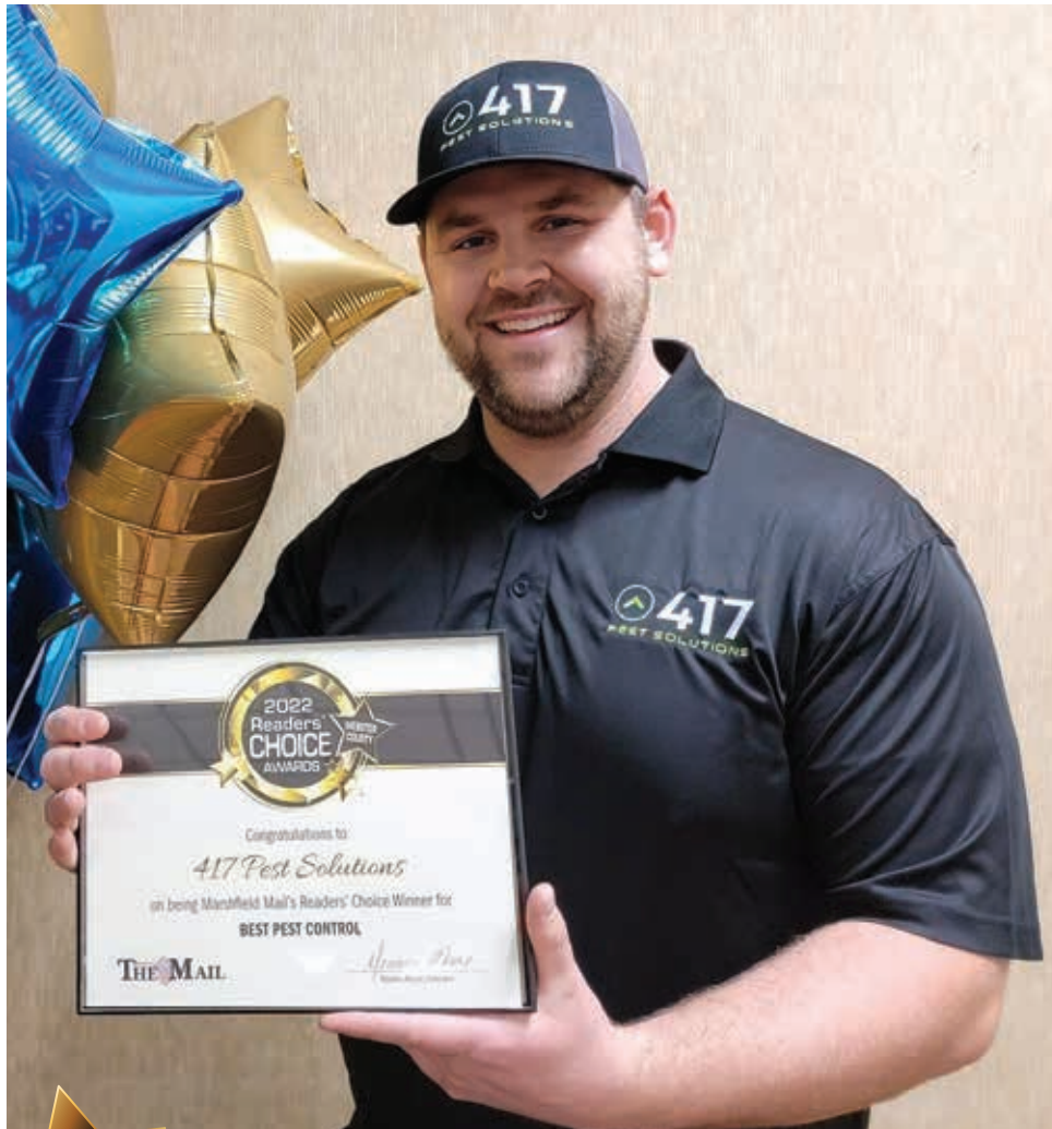
BEST PEST CONTROL | 417 Pest Solutions