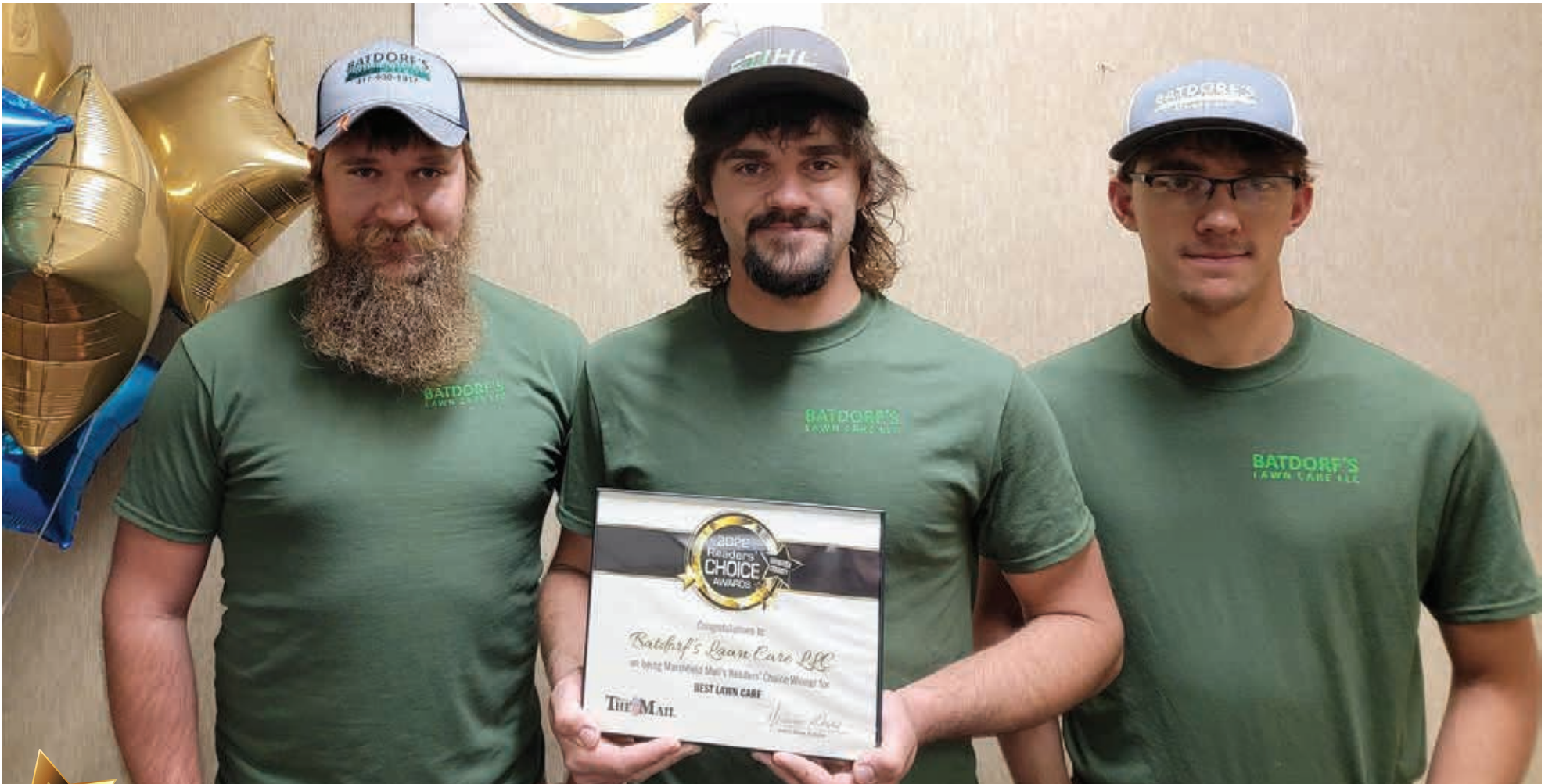
★ BEST LAWN CARE | Batdorf's Lawn Care LLC