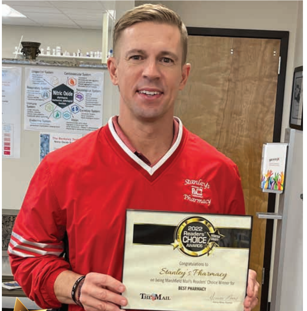
BEST PHARMACY | Stanley's Pharmacy