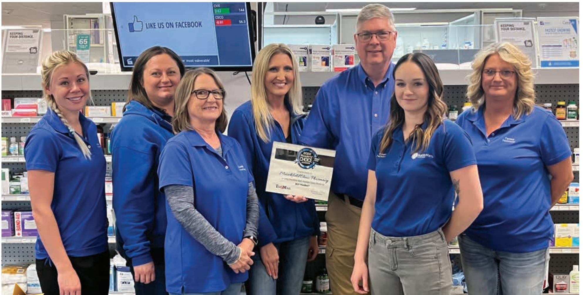
BEST PHARMACY RUNNER UP | Marshfield Family Clinic Pharmacy