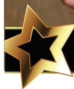
BEST BOUTIQUE RUNNER UP | The Shabby Sheep