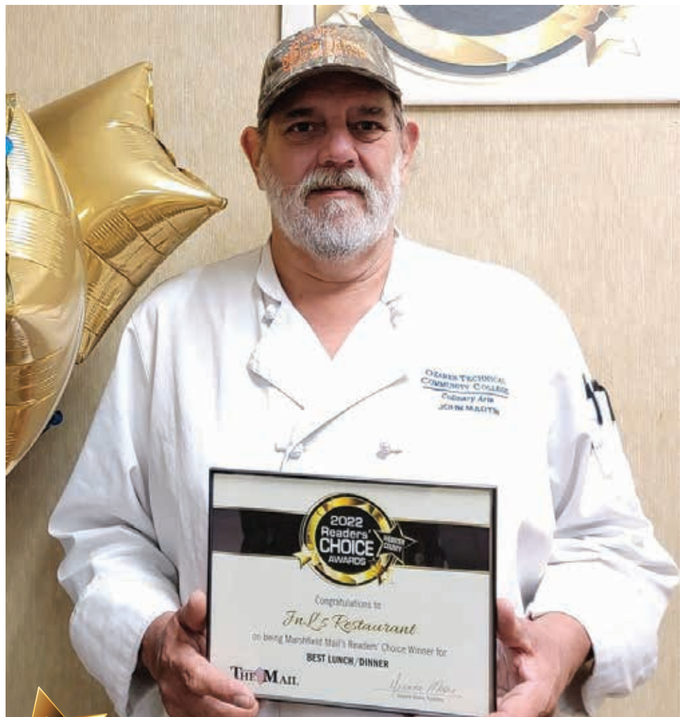
★ BEST LUNCH & DINNER | JnL's Restaurant