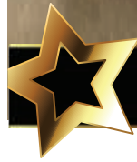
BEST COFFEE SHOP | Prickly Cactus Coffee