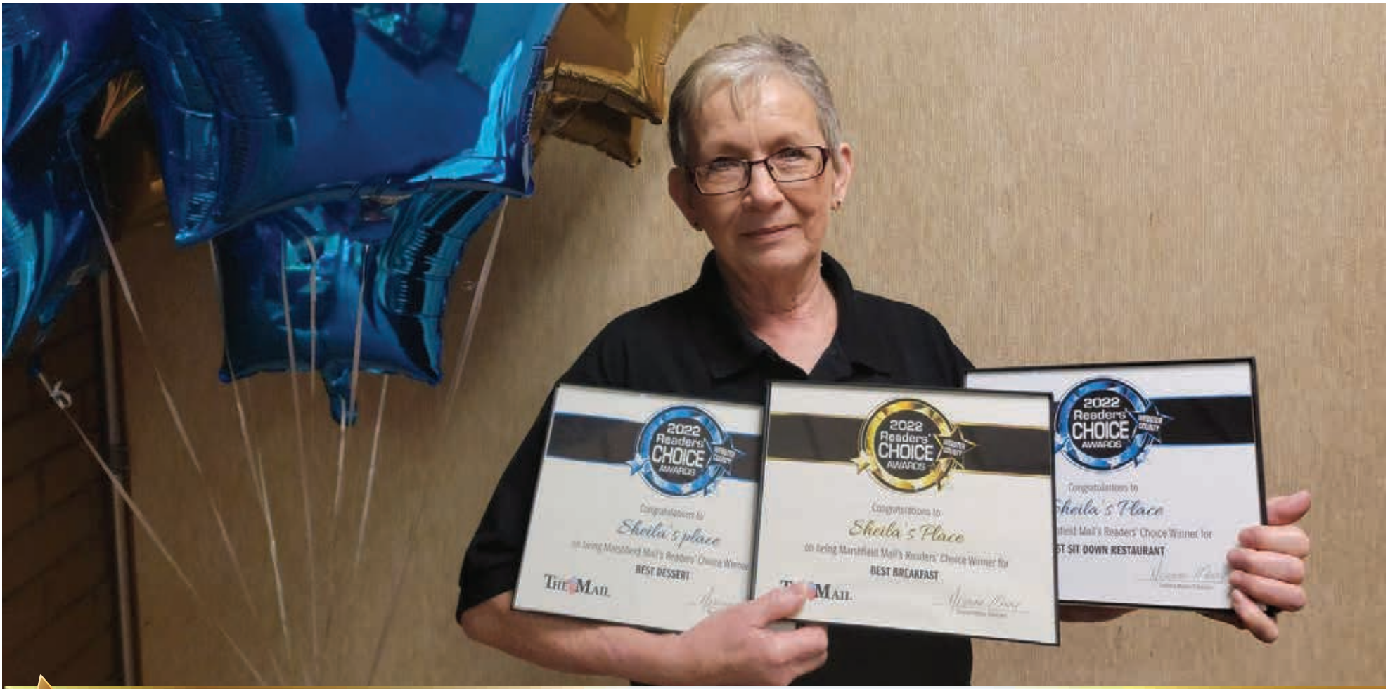
BEST BREAKFAST | BEST SIT-DOWN RESTAURANT RUNNER UP | BEST DESSERT RUNNER UP Shelia's Place