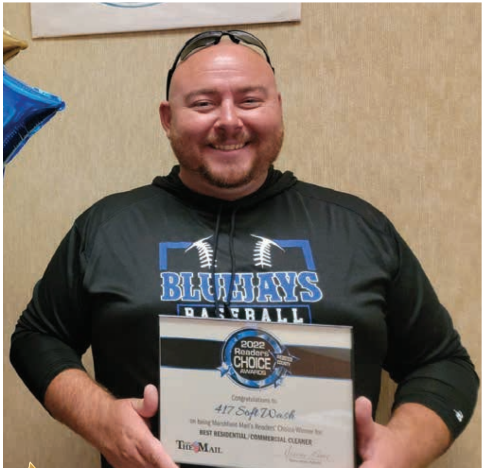
BEST RESIDENTIAL/COMMERCIAL CLEANER RUNNER UP | 417 Soft Wash