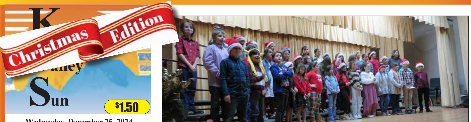
Wednesday, December 25, 2024