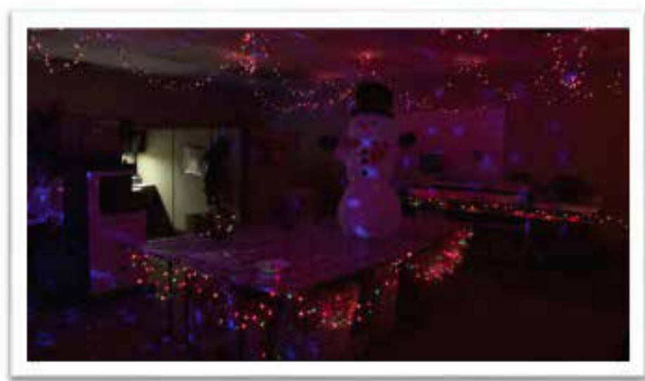
Department Decor: Mail Room

At Corporate Headquarters, a contest was afoot on Christmas Eve! Who had the best decor and the absolutely greatest ugly sweater? Look below to find out.