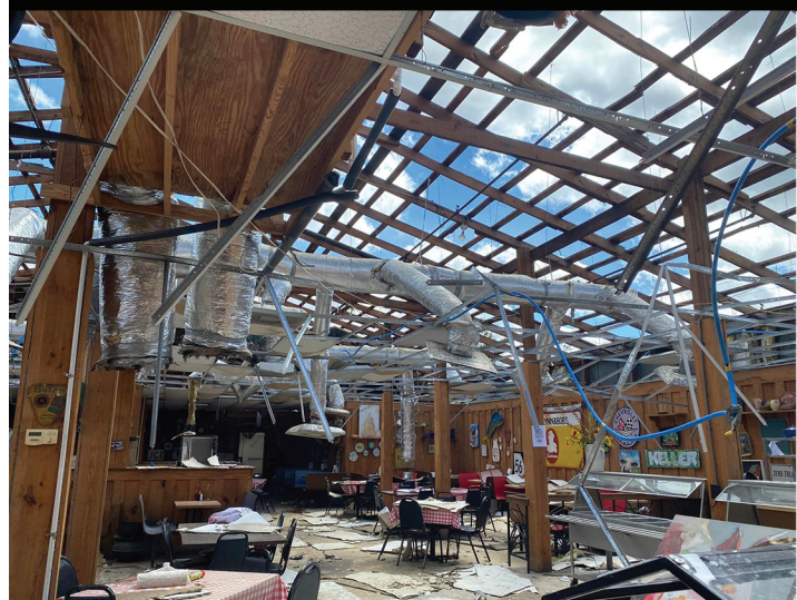
LYNN & BOB'S INTERIOR