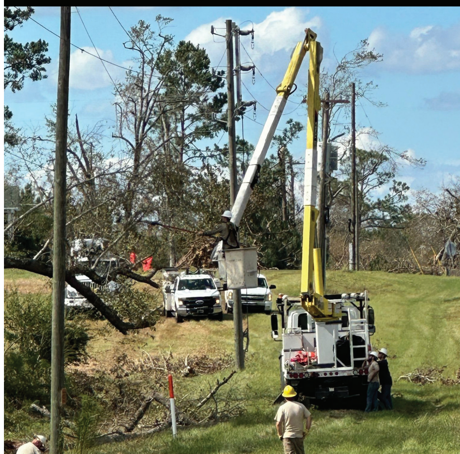
ALTAHAHA EMC LINEMEN HARD AT WORK