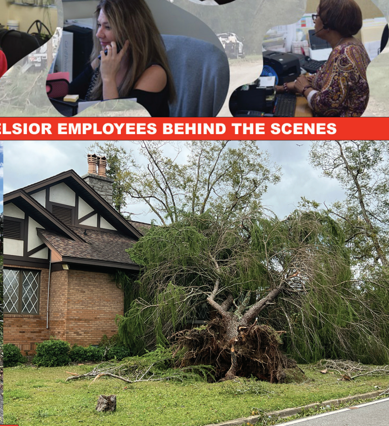
RAY CLINIC IN SWAINSBORO