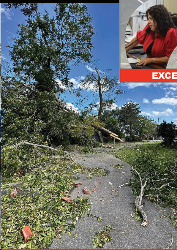
STORM DAMAGE OFF OF RACETRACK STREET