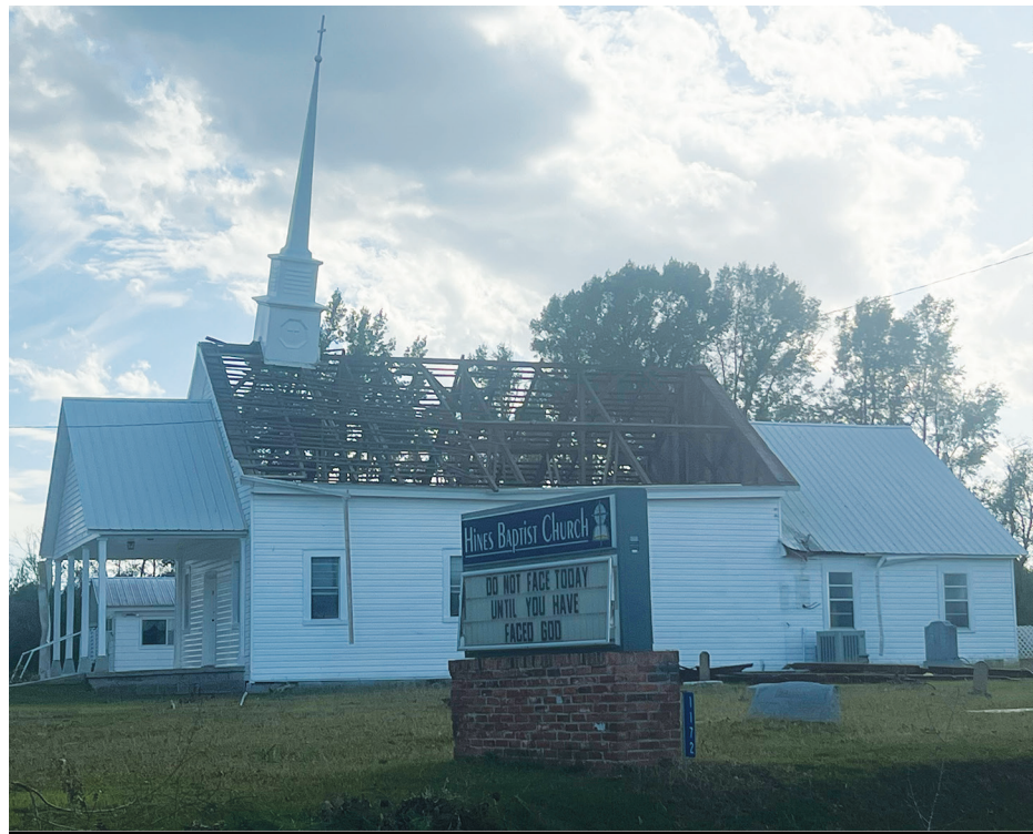
HINES BAPTIST CHURCH NEAR MIDVILLE