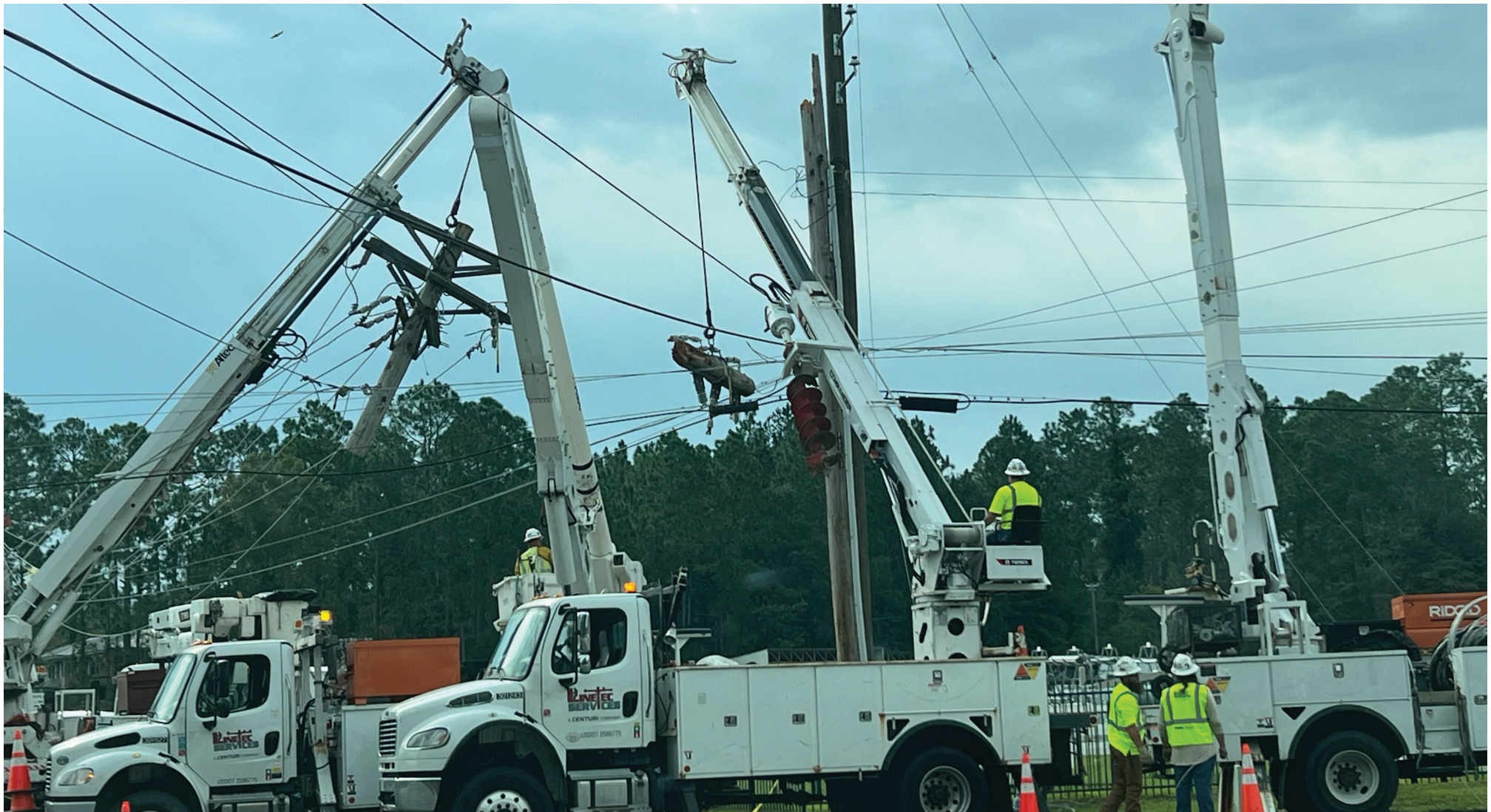
LINEMEN AT WORK ON HIGHWAY 80 EAST