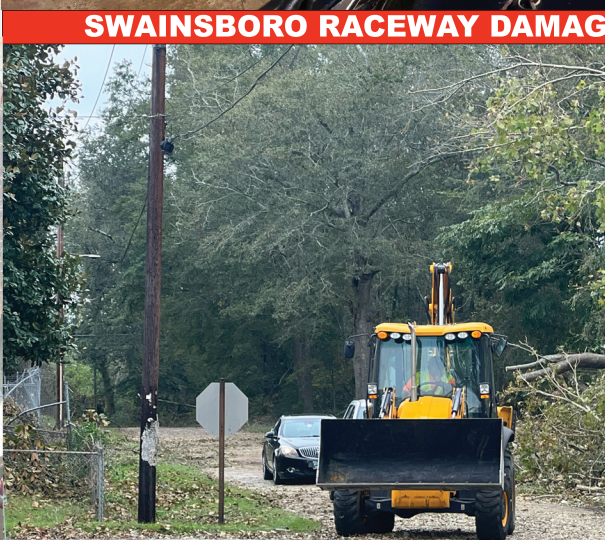
COUNTY WORKER OFF OF COLEMAN STREET IN SWAINSBORO