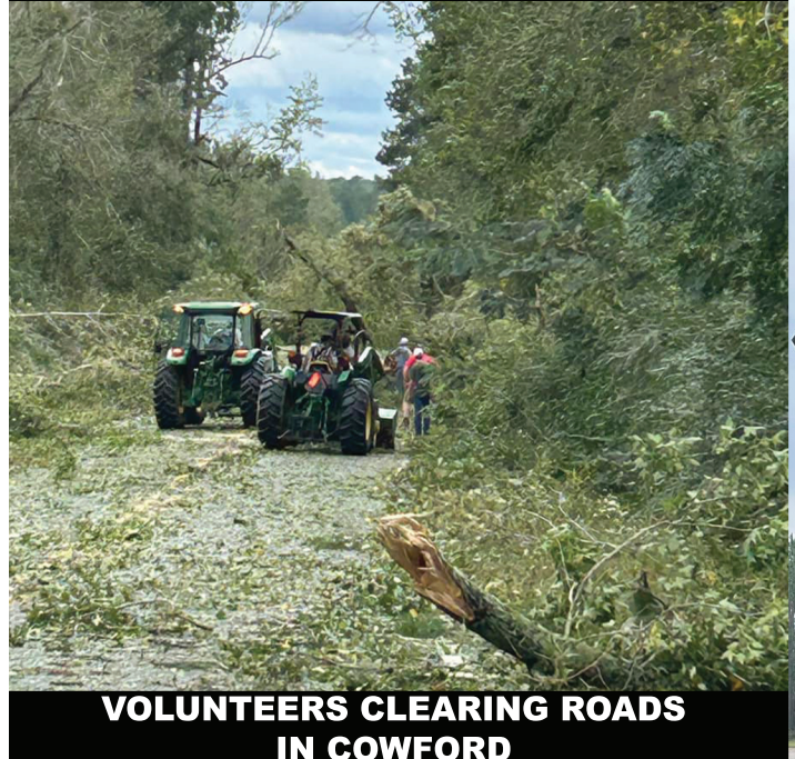
VOLUNTEERS CLEARING ROADS IN COWFORD