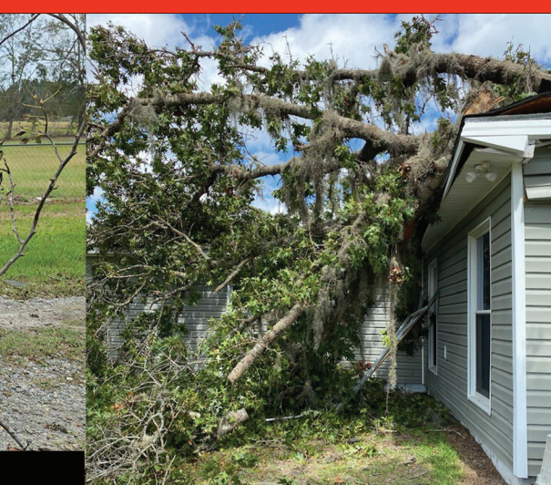
DAMAGE ON KEMP ROAD