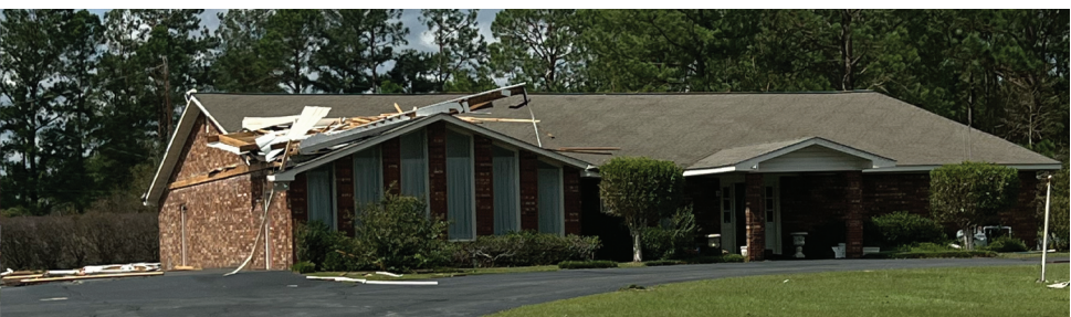
TOMLINSON FUNERAL HOME