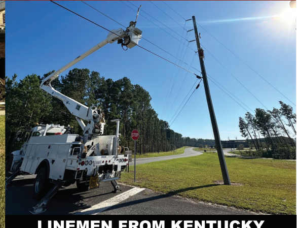
LINEMEN FROM KENTUCKY HELPING US OUT