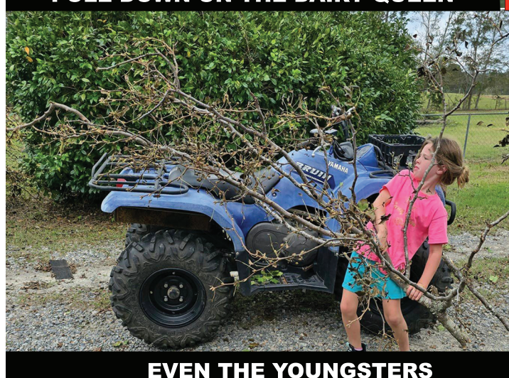
EVEN THE YOUNGSTERS ARE GIVING A HELPING HAND