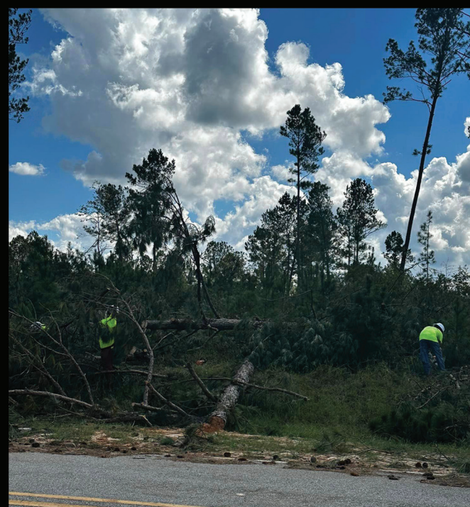
JEFFERSON ENERGY HARD AT WORK

A GREAT BIG 'THANK YOU' TO EVERYONE WHO HAS GONE ABOVE AND BEYOND THROUGH THESE DIFFICULT TIMES! WE ARE TRULY BLESSED TO LIVE IN A COMMUNITY WHERE PEOPLE COME TOGETHER!