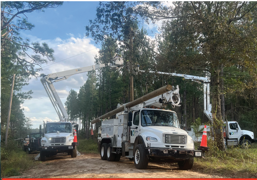
LINEMEN FROM MISSOURI GETTING IT DONE