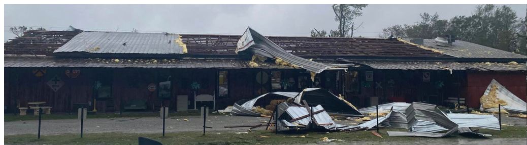
LYNN & BOB'S EXTERIOR DAMAGE