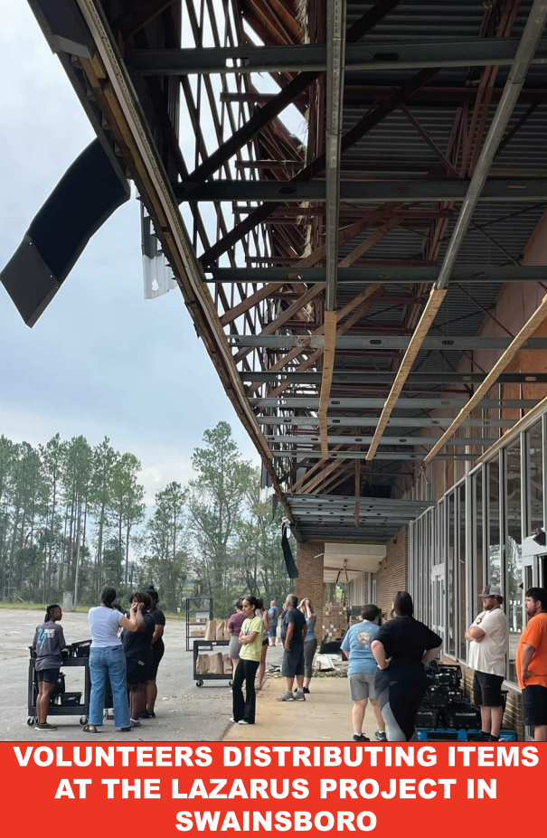
VOLUNTEERS DISTRIBUTING ITEMS AT THE LAZARUS PROJECT IN SWAINSBORO