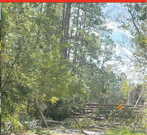
ARDEN DRIVE SWAINSBORO