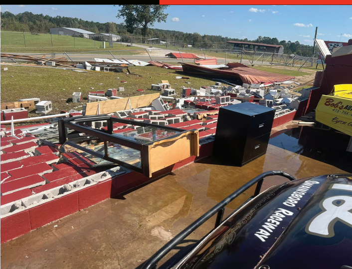
SWAINSBORO RACEWAY DAMAGE