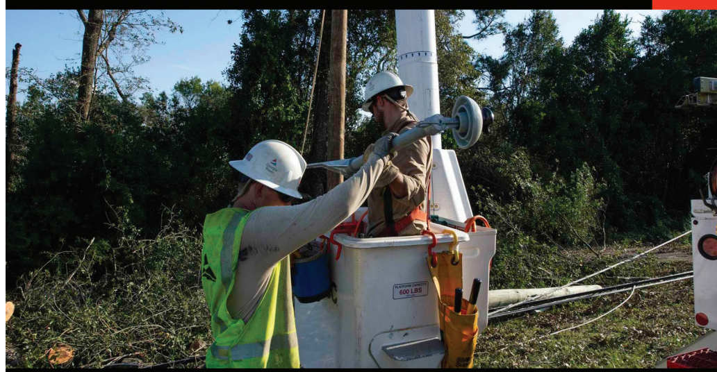
GEORGIA POWER LINEMEN PAYING THE SACRIFICE