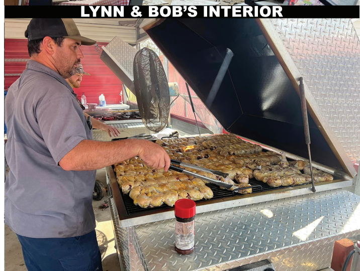
SWAINSBORO RACEWAY OWNER AND VOLUNTEERS COOKING FOR THE PUBLIC AT SWAINSBORO RACEWAY