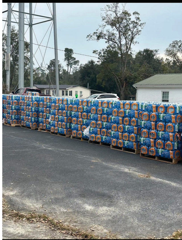
GARFIELD GETTING READY TO DISTRIBUTE WATER