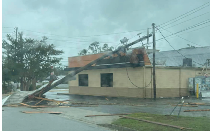
POLE DOWN ON THE DAIRY QUEEN