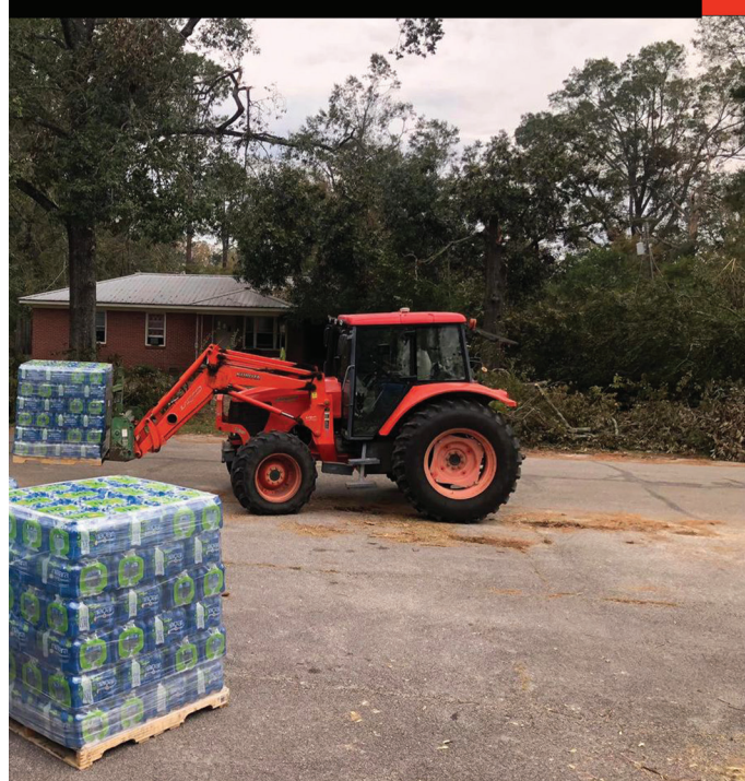
SUMMERTOWN VOLUNTEERS GETTING PREPARED TO HAND OUT WATER

A GREAT BIG 'THANK YOU' TO EVERYONE WHO HAS GONE ABOVE AND BEYOND THROUGH THESE DIFFICULT TIMES! WE ARE TRULY BLESSED TO LIVE IN A COMMUNITY WHERE PEOPLE COME TOGETHER!