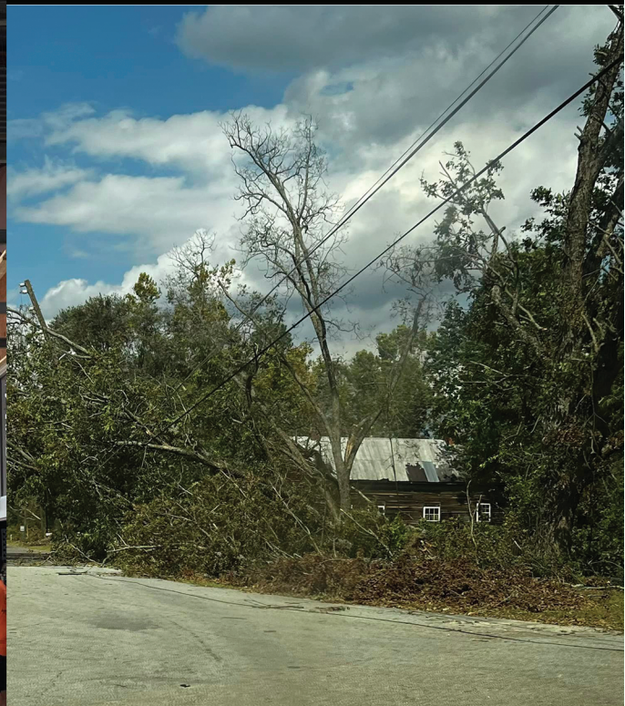
HURRICANE DAMAGE