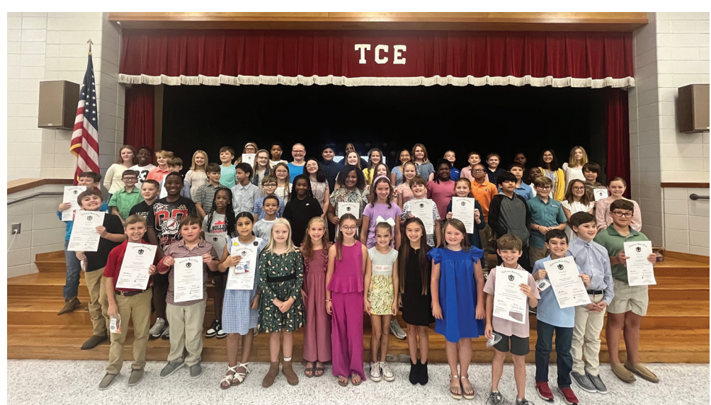
JR. BETA INDUCTEES