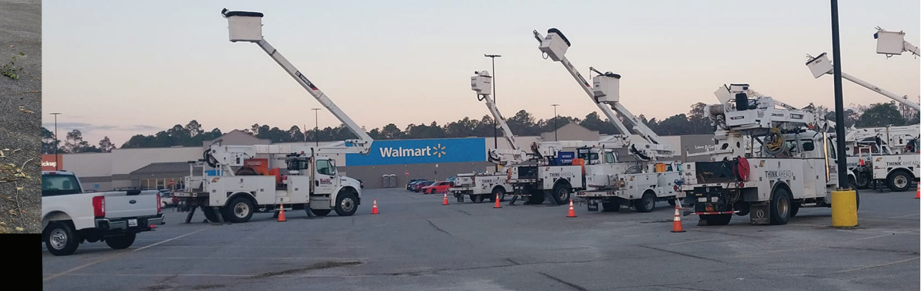
LINEMEN FROM INDIANA COMING TO OUR RESCUE