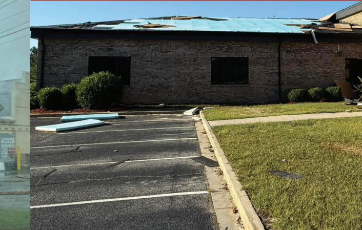
SWAINSBORO MIDDLE SCHOOL BAND ROOM