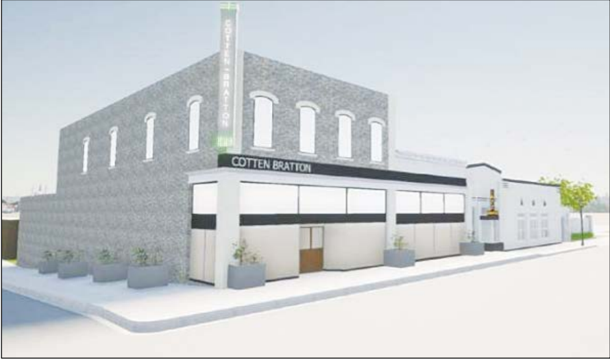
CITY OF WEATHERFORD

Council voted to move ahead with a restaurant incentive that was