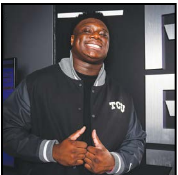
TCU SPORTS INFORMATION

Here are some other area athletes who saw action in the college football season now past.