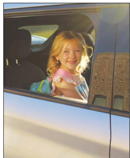
It was all smiles for the kids in the Vandergriff carpool line.