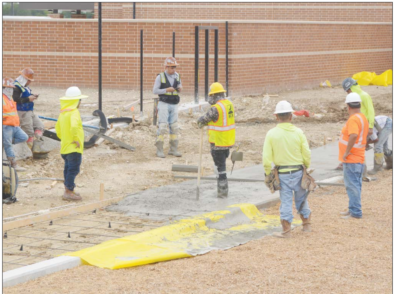
Sidewalks are poured past one of McKinney Elementary School's two playgrounds.