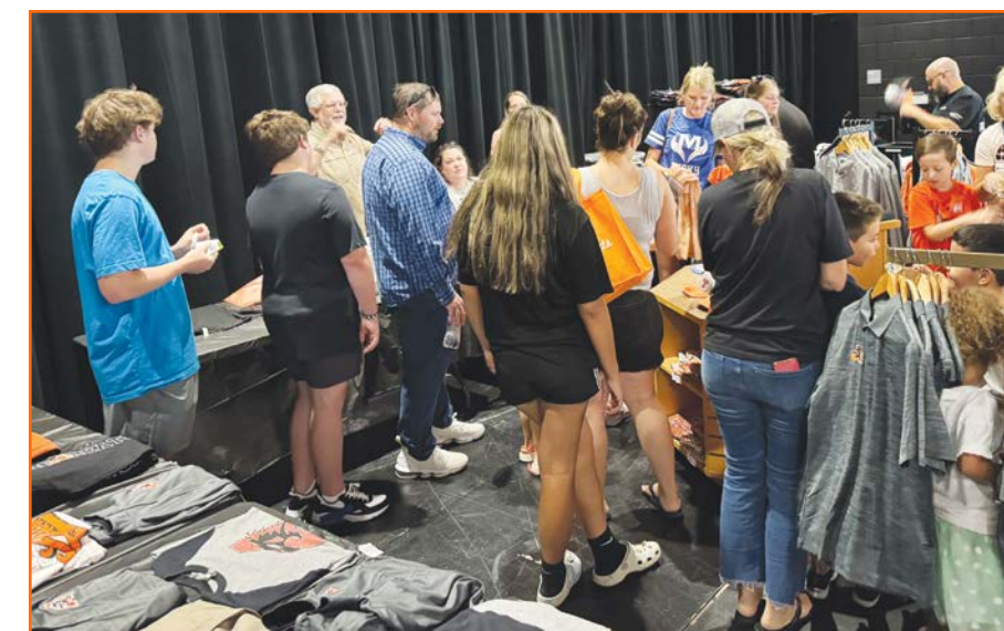
Shopping for Aleido merchandise.