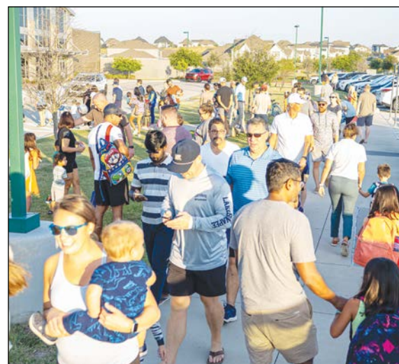
Students and parents swarm Walsh Elementary School for the first day of school.