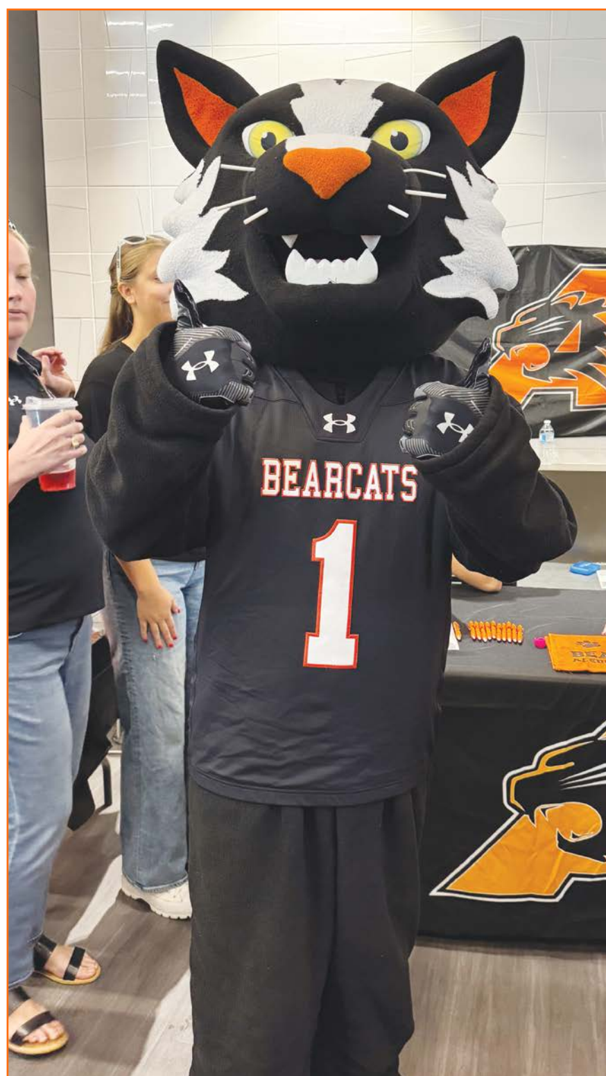
The Bearcat mascot