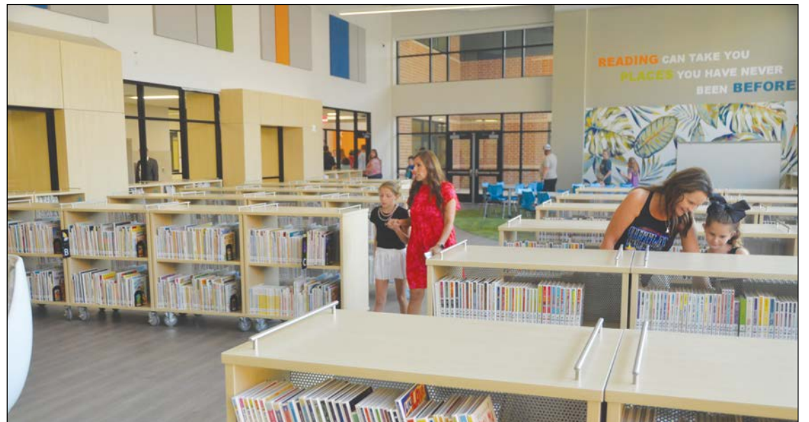
Library shelves are low for easy access and so students can see across the room.