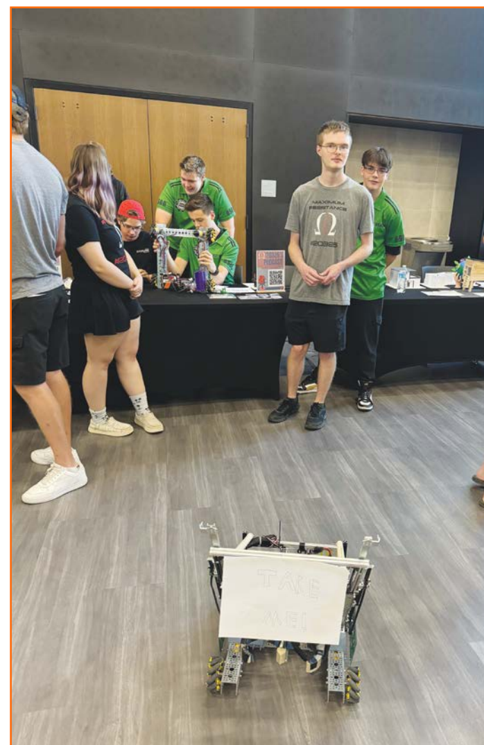
Robotics team showed their skills

The annual Bearcat Nation 101 event had a new location but the same enthusiastic group of organizations that provided much needed information to new and veteran residents in the Aleido ISD. The tradition location at Aleido High School gave way to McAnally Middle School due to construction at AHS. Cities, campuses, and school organizations provided handouts, samples, and lots of sweets to participants.