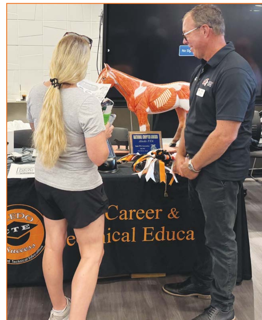
People gathered to talk about different school activities.