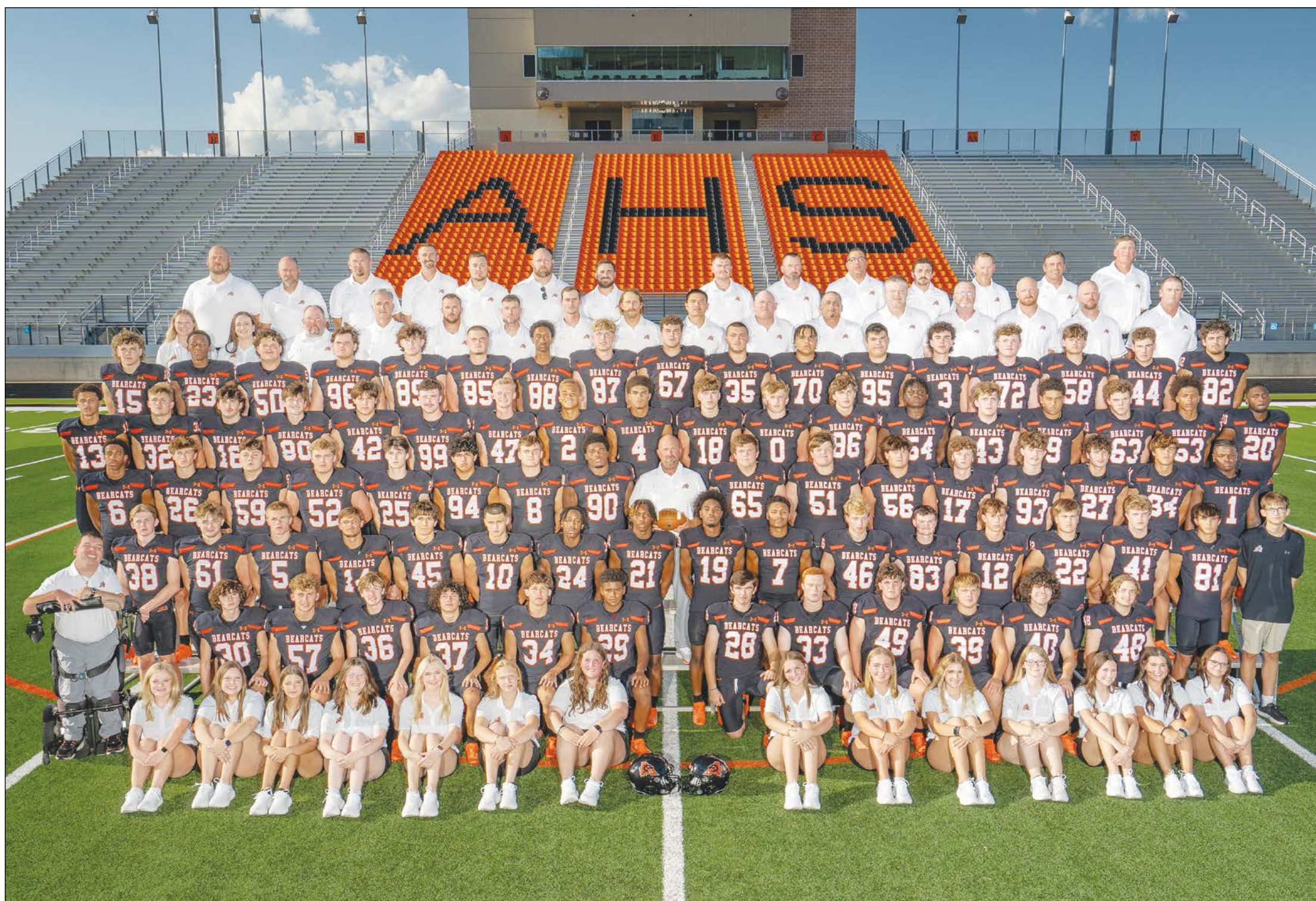
Aleo Bearcat Varsity Team