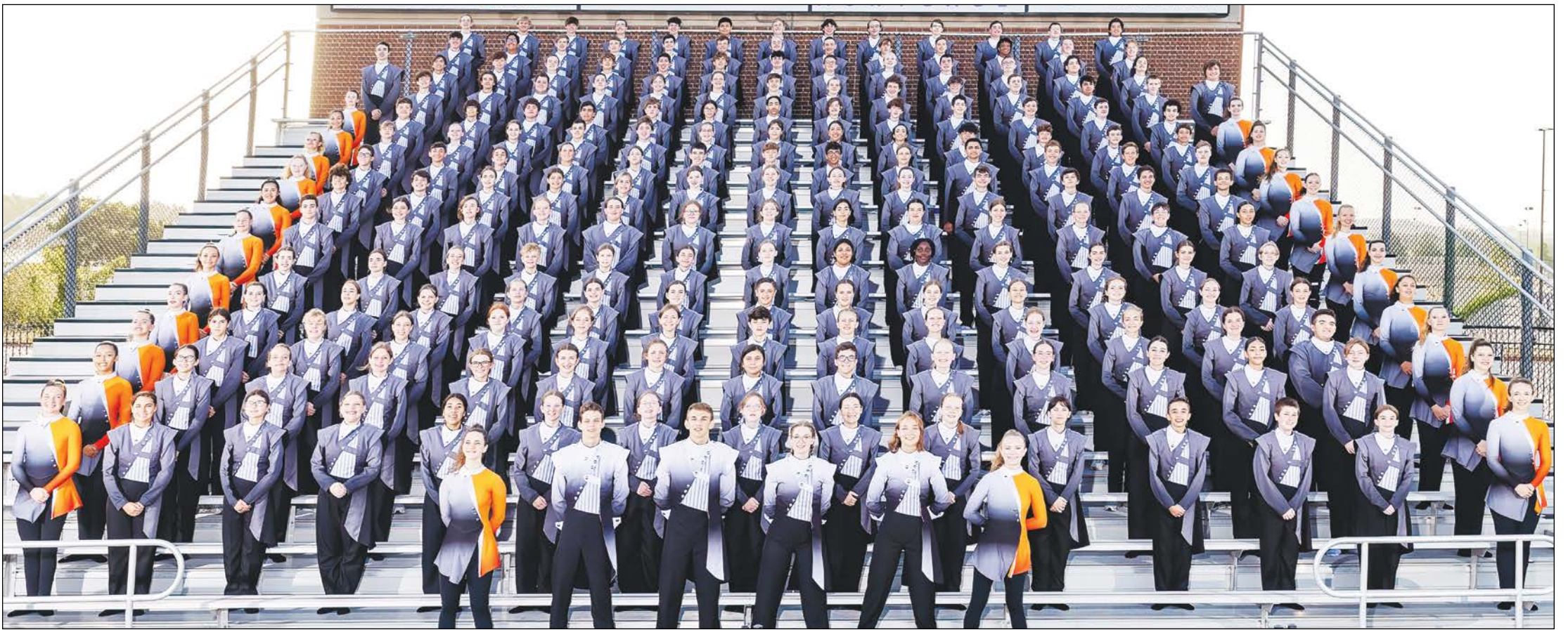
The Aledo Bearcat Regiment will be on the field at halftime and providing music and cheers during games, in addition to their busy contest schedule.