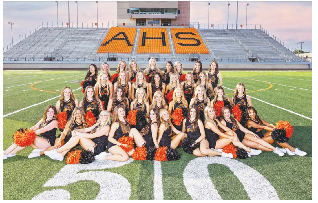
The Aledo Varsity Cheerleaders