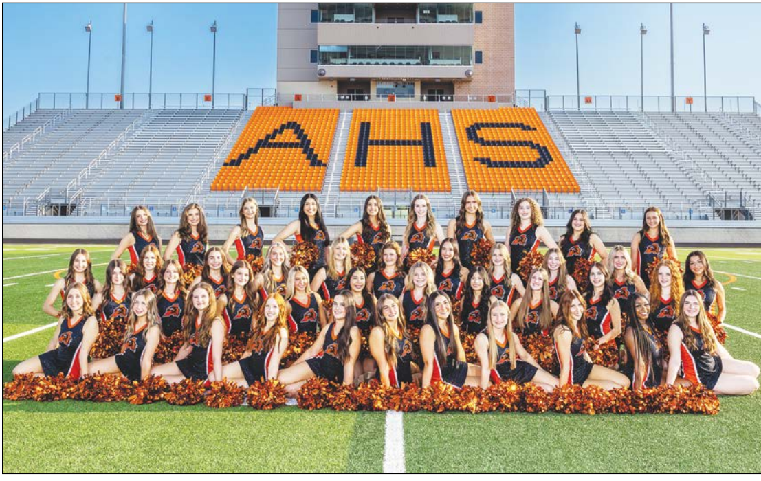
Aledo Varsity Dance Team