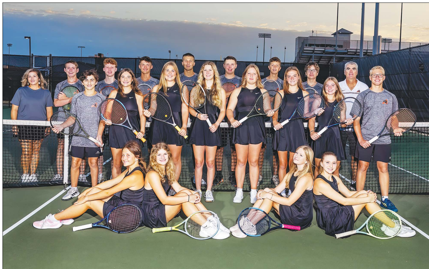
The Aledo High School varsity tennis team.