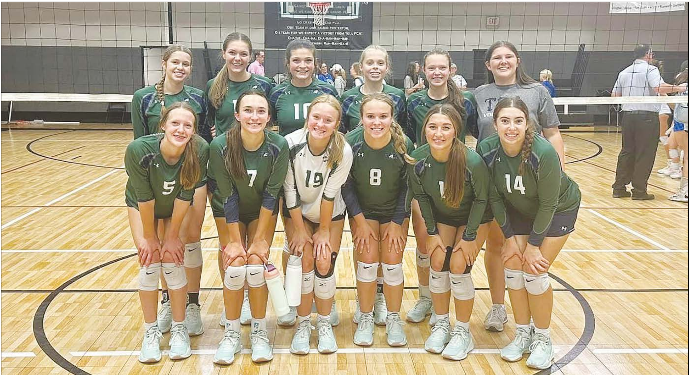
TRINITY CHRISTIAN ACADEMY