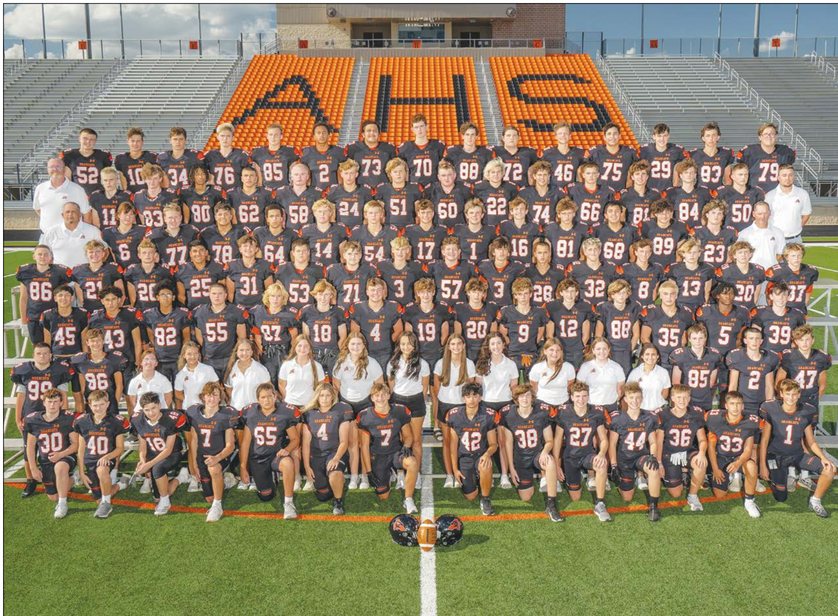
Aledo Bearcat Freshmen Team