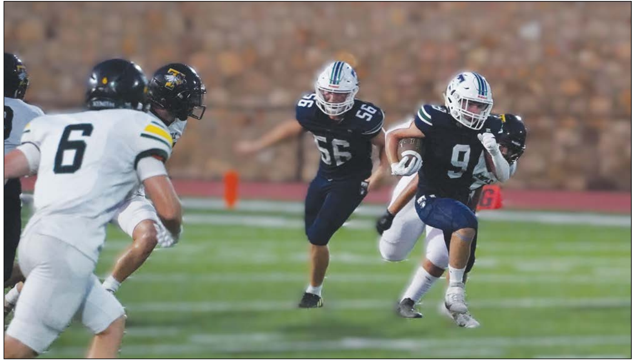
TRINITY CHRISTIAN ACADEMY