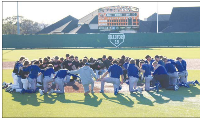
ALEDO BEARCAT BASEBALL

The one team that did lose a significant amount of talent to graduation after last season is Northwest. Although he expects the Texans to have a significant amount of new names in the