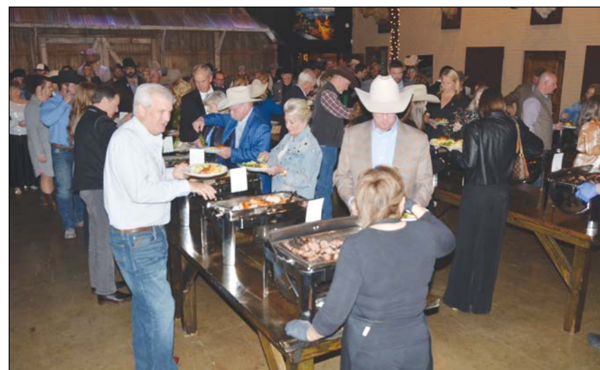
Attendees enjoyed delicious food and live music.