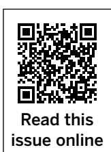
Read this issue online

The Bearcat Regiment Percussion Ensemble won first place and all captions awards at the 2022 HEB Drumline Contest on Sept.17.