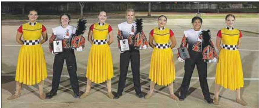
The Aledo High School Bearcat Regiment won first place and won Outstanding Percussion and Music at the Mansfield Preview of Champions on Sept. 25 after winning all captions in the prelims.

The Philip W. Bradford Agriculture Science Building at Aledo High School sported a striking new exterior addition on Sept. 20 after installation of a mural by department students. The mural's development came about as the result of efforts by the school's Future Farmers of America (FFA) chapter.