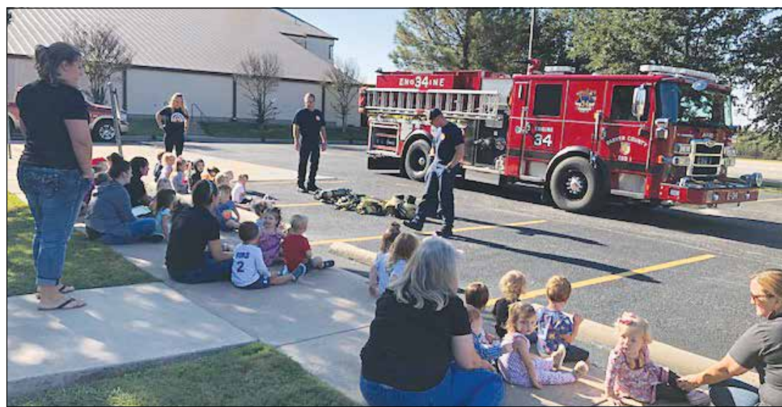
Lil' Cats Preschool from the Church at the Crossing in Aledo recently completed fire safety month with a visit from the Aledo Fire Department last Tuesday, and a pre-k tour of the fire station on Thursday.