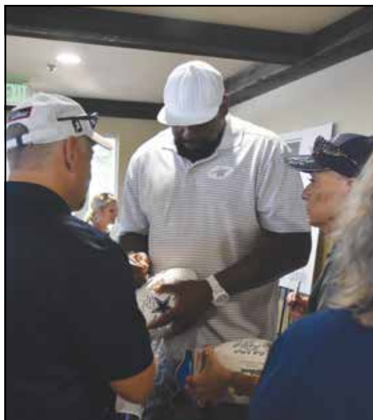
Ed "Too Tall" Jones signs autographs.