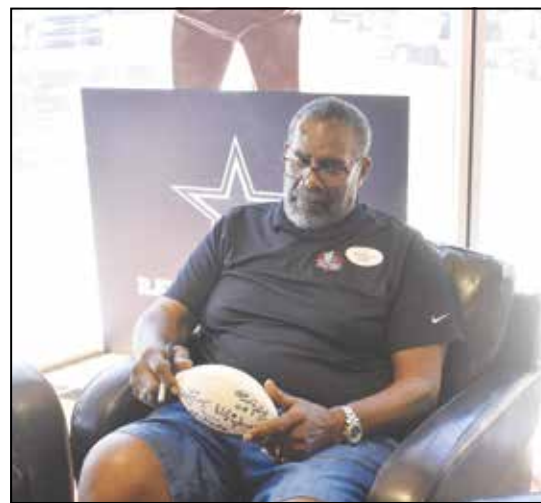
"Mean Joe Greene" signs footballs