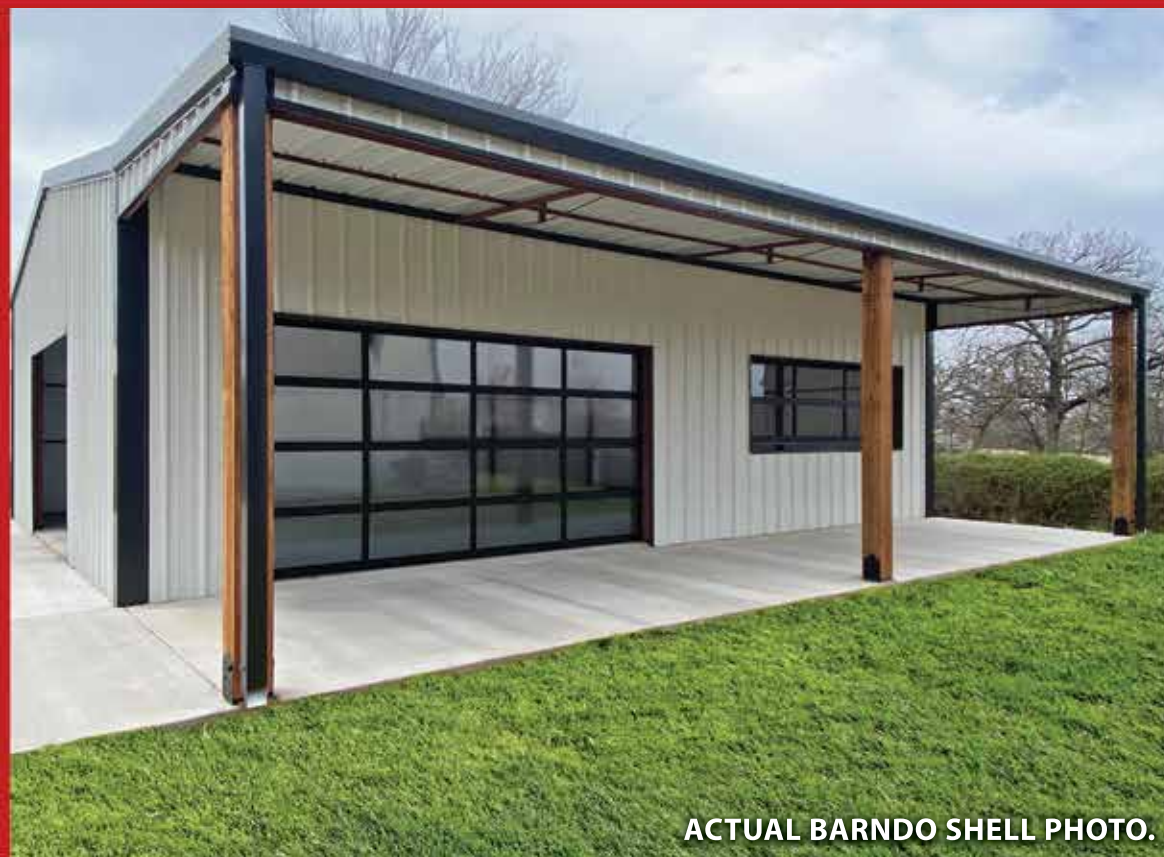
ACTUAL BARNDOMINIUM SHELL PHOTO.