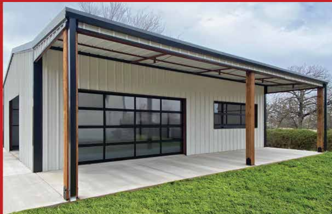
ACTUAL BARNDO SHELL PHOTO.