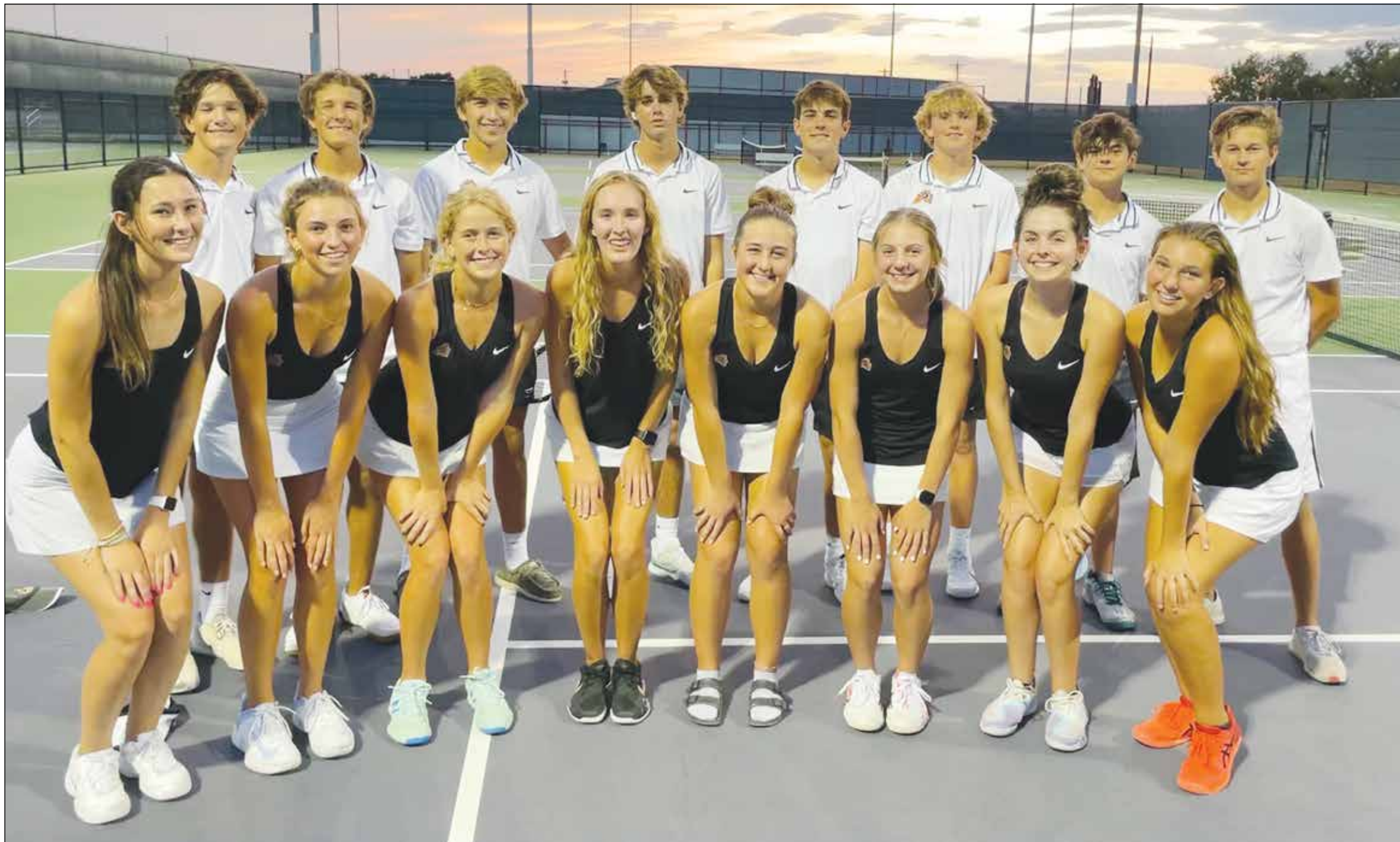
SPECIAL TO THE COMMUNITY NEWS

OCTOBER 8, 2021 THE COMMUNITY NEWS WWW.COMMUNITY-NEWS.COM