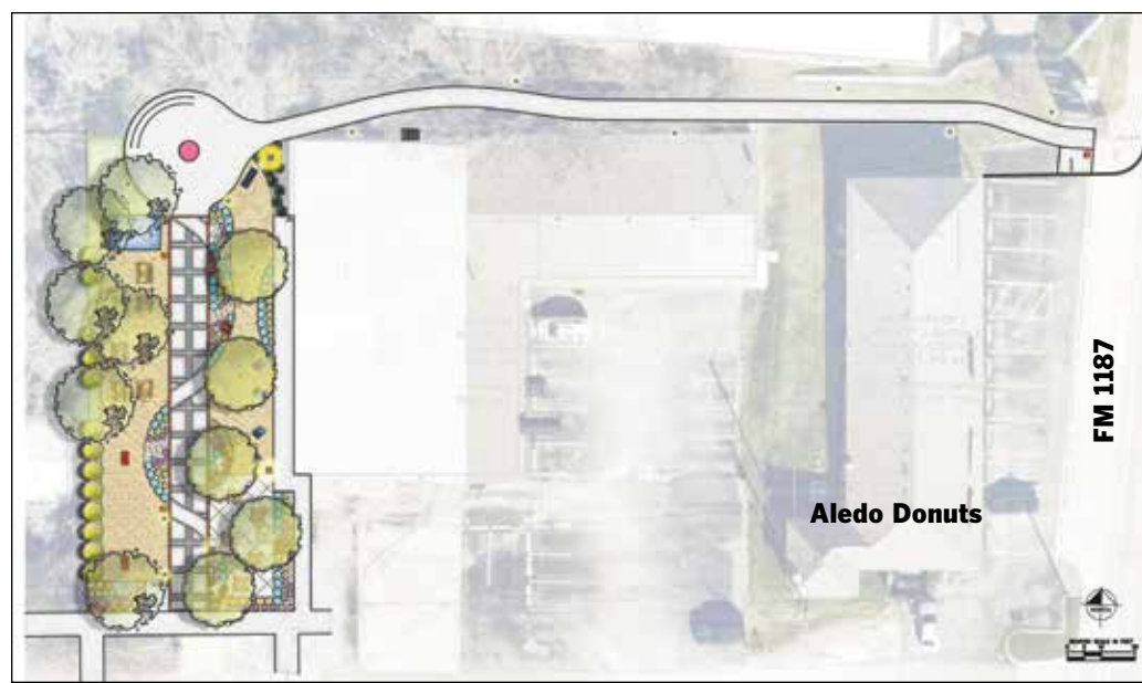
The plaza concept will be an on/off spot for people using the trail and area, but it will also serve as a community amenity for those who wish to visit it. It is located off Jearl Street behind Aledo Donuts. It can look like a pocket park, but it will also have trail-related features such as those included in the design.